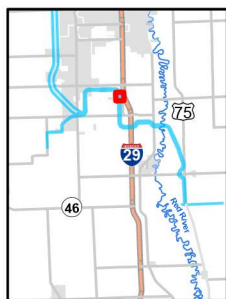
Locator Map Not to Scale

OIN: 1080Y Owner: CASS COUNTY JOINT WATER RESOURCE DISTRICT PIN: 64-0000-02500-060 Cass County, ND FM AREA DIVERSION Map Date: 8/30/2024