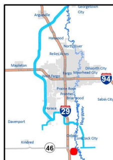
Locator Map Not to Scale

OIN: 1478 CHAD E PATRICK Parcel ID: 01-0000-00081.155 Richland County, ND