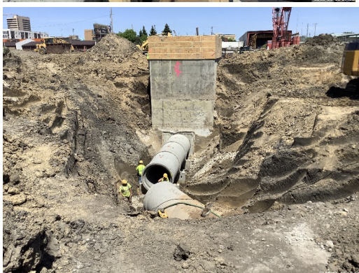
WP-42E Gatewell Structure