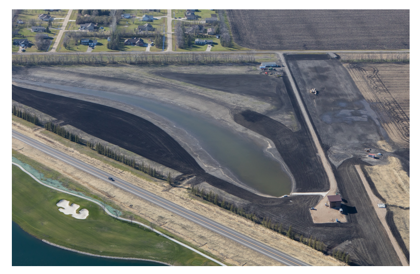
WP-43CD Pump Station and Storm Water Pond