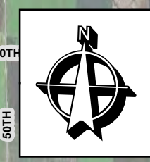
Diversion Channel Alignment Overall Diversion Alignment, November 2012