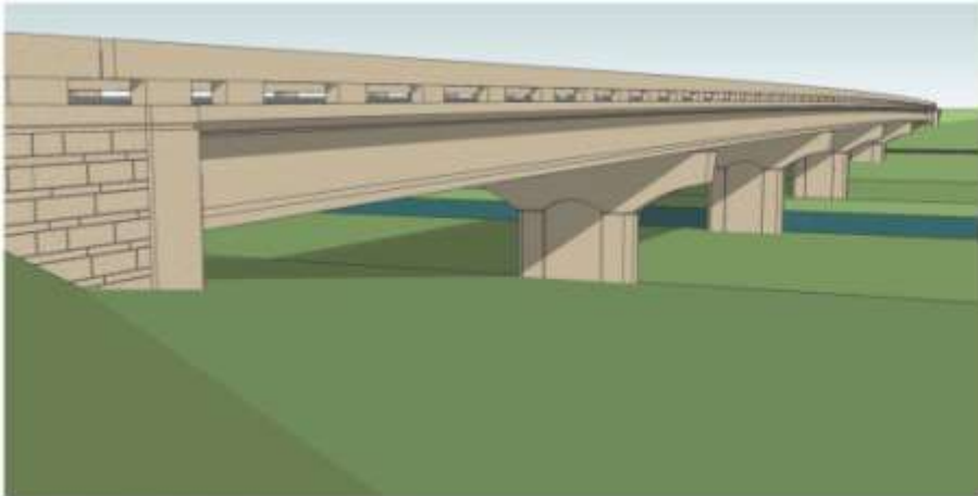
Long View of Bridge from Abutment