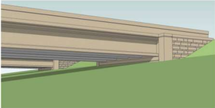
Detail View of Abutment