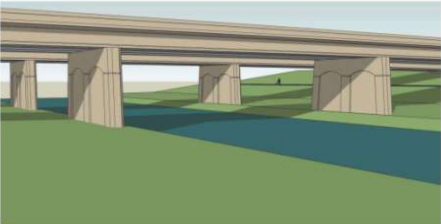
Detail View of Center Span Over Low Flow Channel