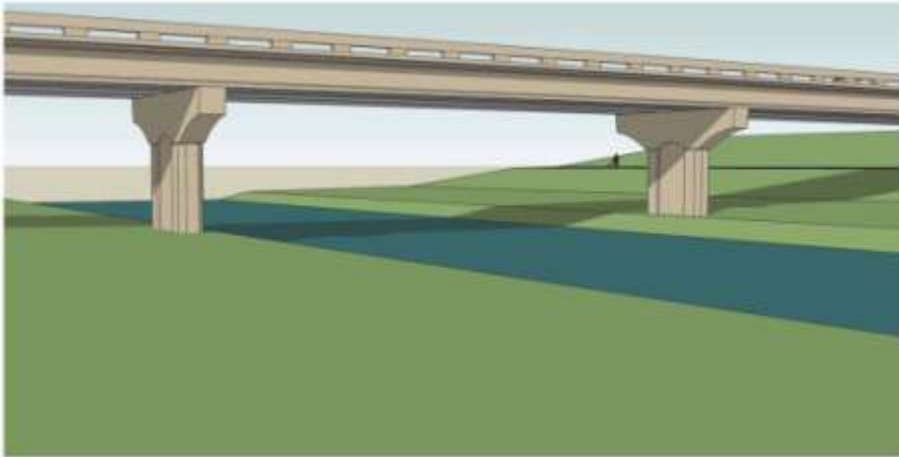
Detail View of Center Span Over Low Flow Channel