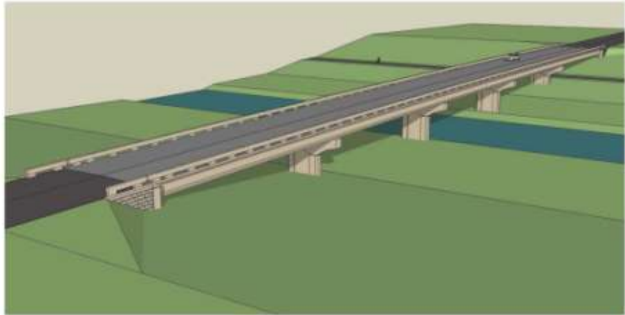
Aerial View of Bridge