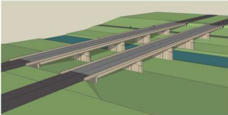
Aerial View of Bridge