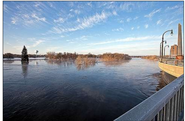
Fargo-Moorhead - 2009